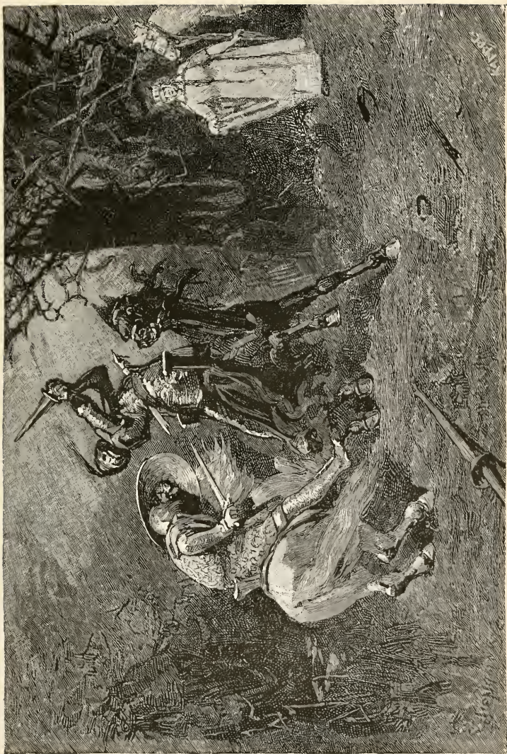
The Knight of the Black Lawns.